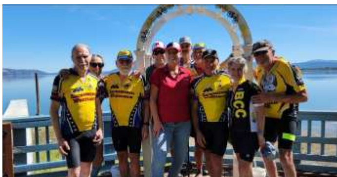
Wheelmen looking GREAT!